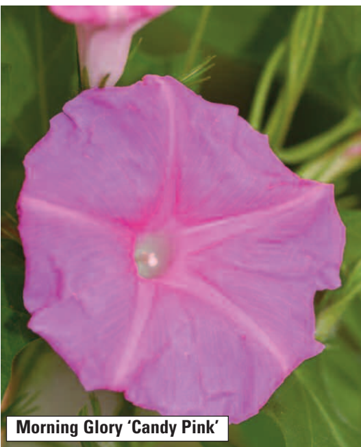
Morning Glory 'Candy Pink'

To locate your nearest Thompson & Morgan stockist call: 01473 688821 or visit our website.