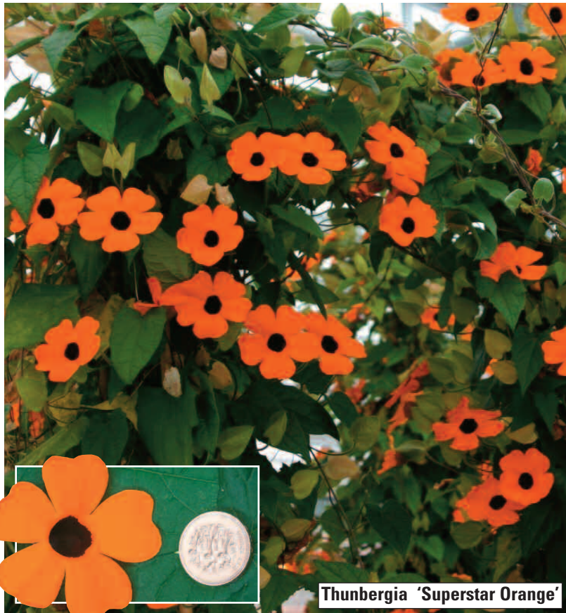
Thunbergia 'Superstar Orange'

Also new to the Climbing Garden range for 2007 is Ipomoea tri-color 'Candy Pink' .